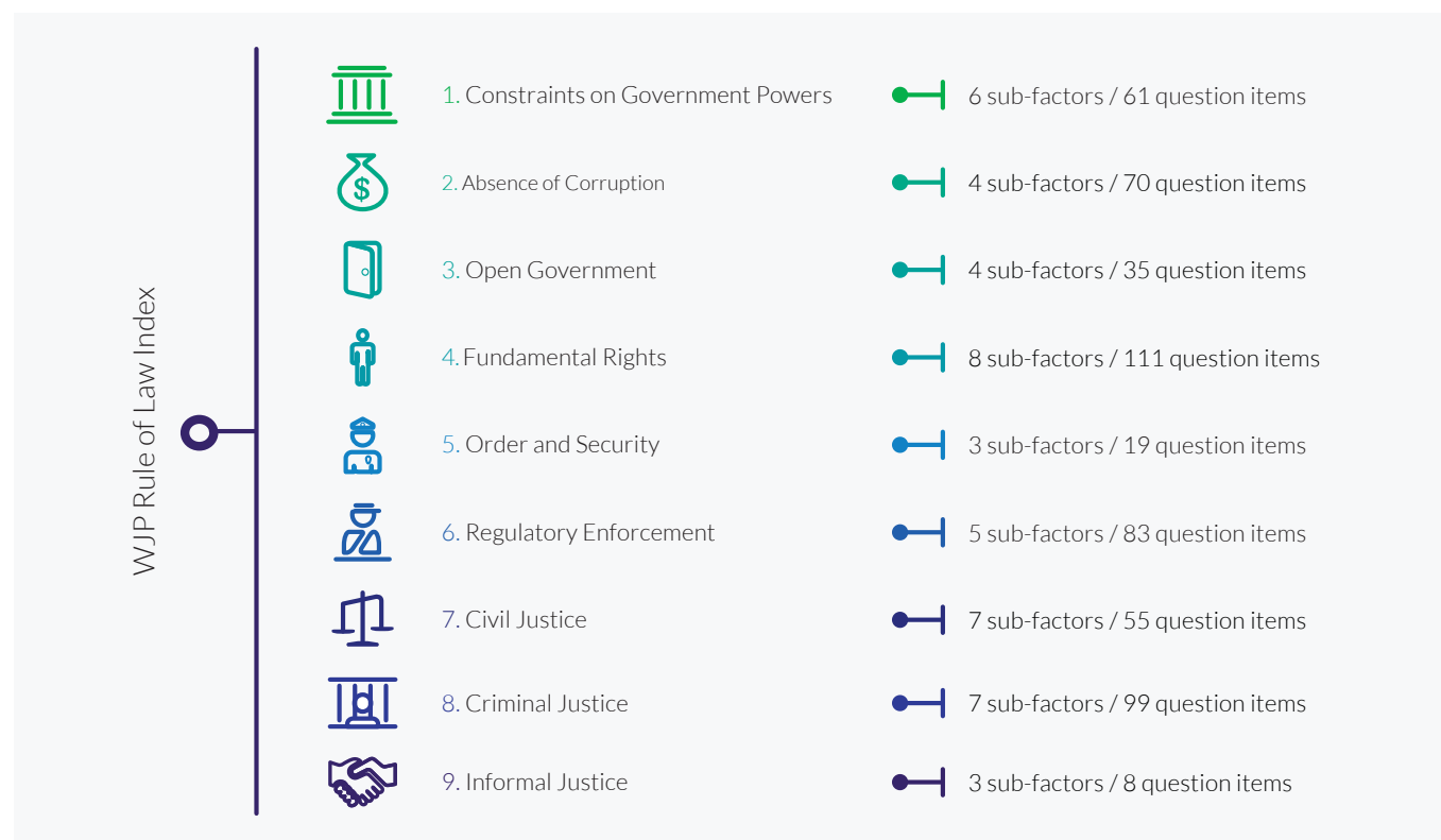
FIGURE 1. SCHEMATIC REPRESENTATION OF THE 2014 RULE OF LAW FRAMEWORK AND INDEX.

Notes: Rearranged from the information provided on the WJP Rule of Law Index 2014 main report.