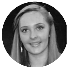
MARINE SIVA European Committee of Regions