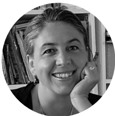
GIORGIA BOLDRINI City of Bologna, Italy